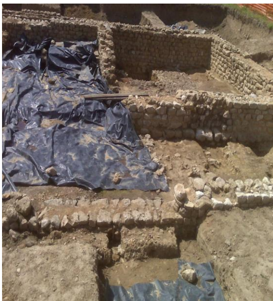
Tufa columnal bases of monumental entrance (facing river) at East Farleigh Roman 'temple' site, author, 19 th September 2010. Possible source of the tufa arch above.