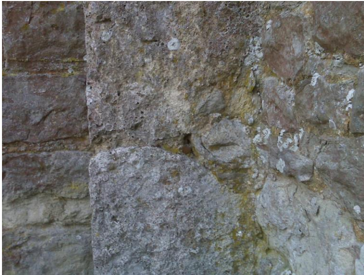
Detail of spolia as above, St Mary's Church, East Farleigh