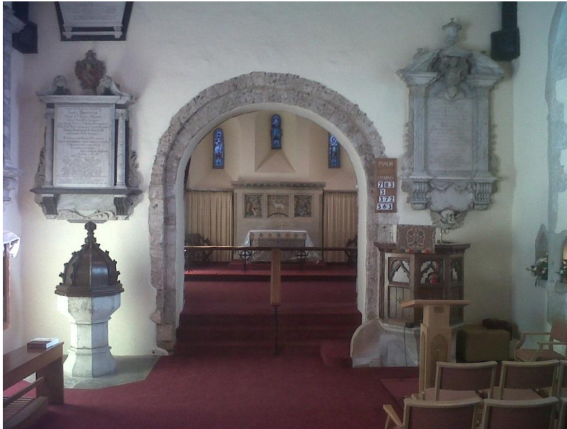
Re-used Roman monumental tufa entrance arch, All Saints Church, West Farleigh author, 11 June 2011.