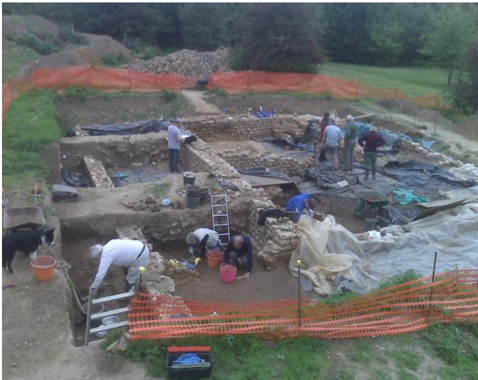
East Farleigh Roman 'temple' site, author, 19 th September 2010.