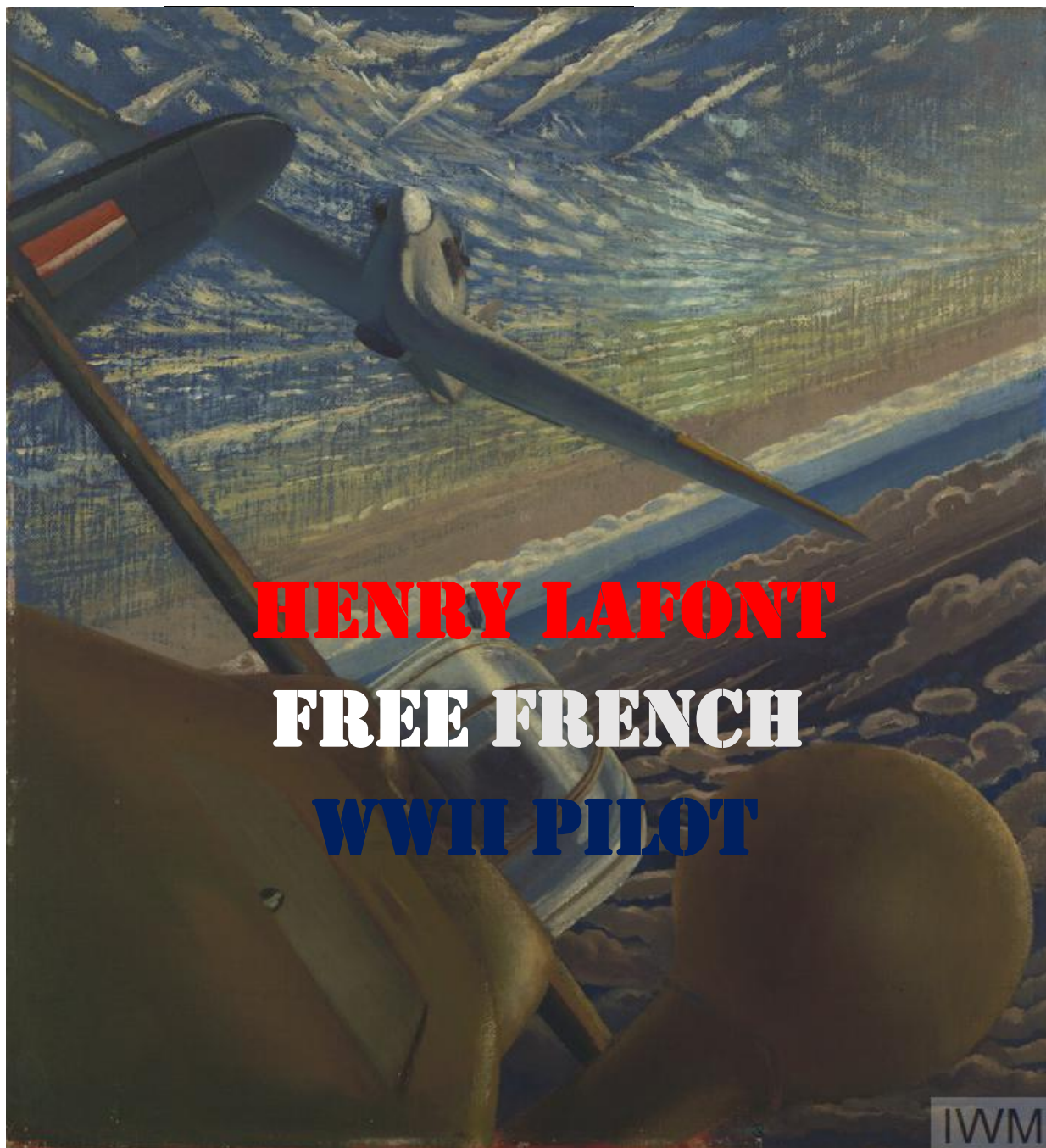
"Fighter Affiliation: Halifax and Hurricane aircraft co-operating in action" Walter Thomas Monnington, 1943 Imperial War Museum