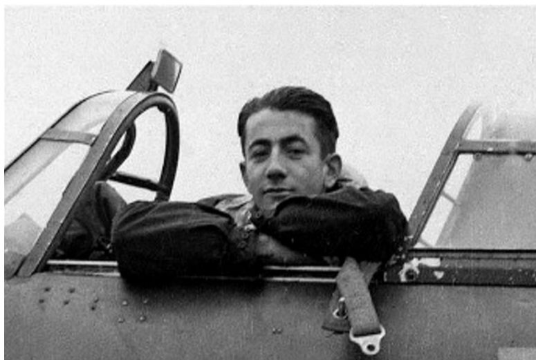
Lafont in the cockpit of his Hurricane Mk 1