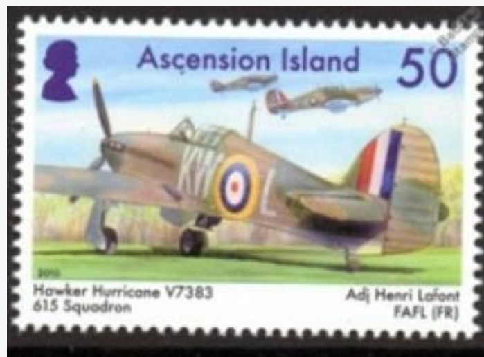
Memorial stamp, Ascension Island, 2010, featuring Henry Lafont's Hawker Hurricane Mk 1