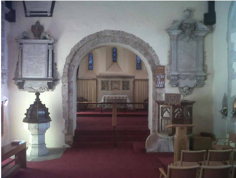
Re-used Roman monumental tufa entrance arch, All Saints Church, West Farleigh author, 11 June 2011.