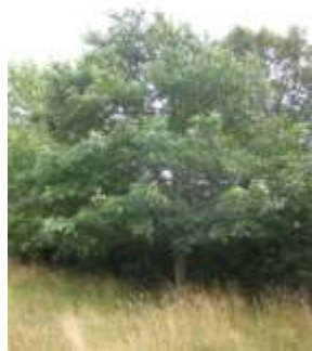
American Red Oak