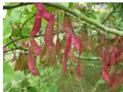
Judas Tree pods