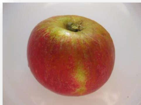
Cox's Orange Pippin