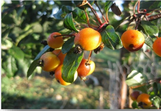
Golden Hornet pollinator